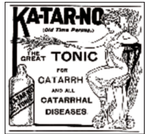
Figure 11: Ad for Ka-Tar-No