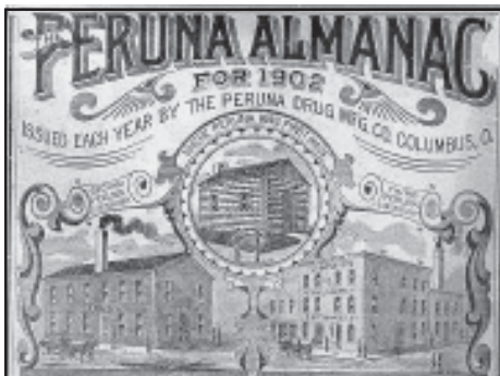
Figure 5: First three Hartman "Laboratories"

At a time when many politicians found it prudent to be born in a log cabin, Dr. Hartman claimed that his remedy had first been invented in such a rustic structure. His almanacs of later years featured his "laboratories." [Figure 5] As shown here, the first is captioned "Where Peruna First Was Made." The second scene shows a modest two-story frame building with the simple sign, "Peruna" over the front entrance and is designated the "Second Peruna Laboratory." Scene 3 shows significant growth. The structure now is three stories and brick, with three chimneys, all belching smoke. Things might have stalled right there. It was the early 1990s and Dr. Hartman is reported to have been struggling to get enough orders