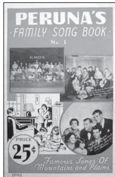
Figure 13: Peruna Song Book