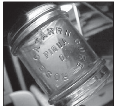
Figure 8: Rose Catarrh bottle