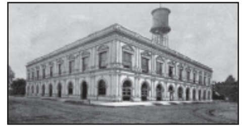
Figure 6: The Peruna Administration Bldg.

Within a fairly short time, Peruna became the largest selling proprietary medicine in the United States. Costing $1 a bottle at a time when 25 cents bought