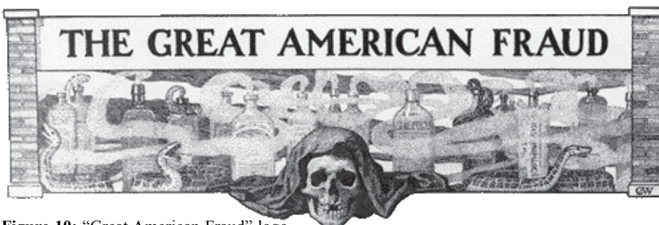
Figure 10: "Great American Fraud" logo